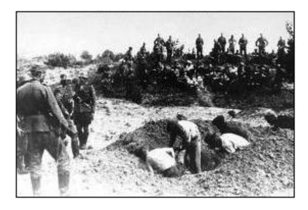
Camp members engaged in one of our many fun-filled organized work activities.

Room and board are provided to each member in exchange for rewarding tasks designed to provide a sense of accomplishment and to demonstrate that large numbers of people CAN exist in a gun violence free community.